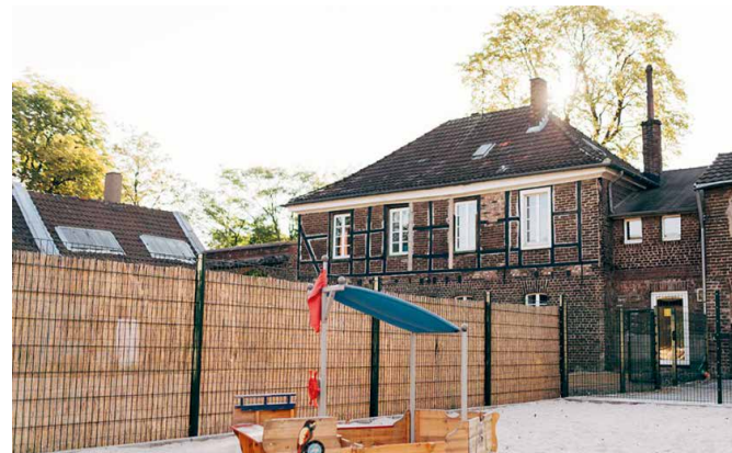
Kita im Kappelshof