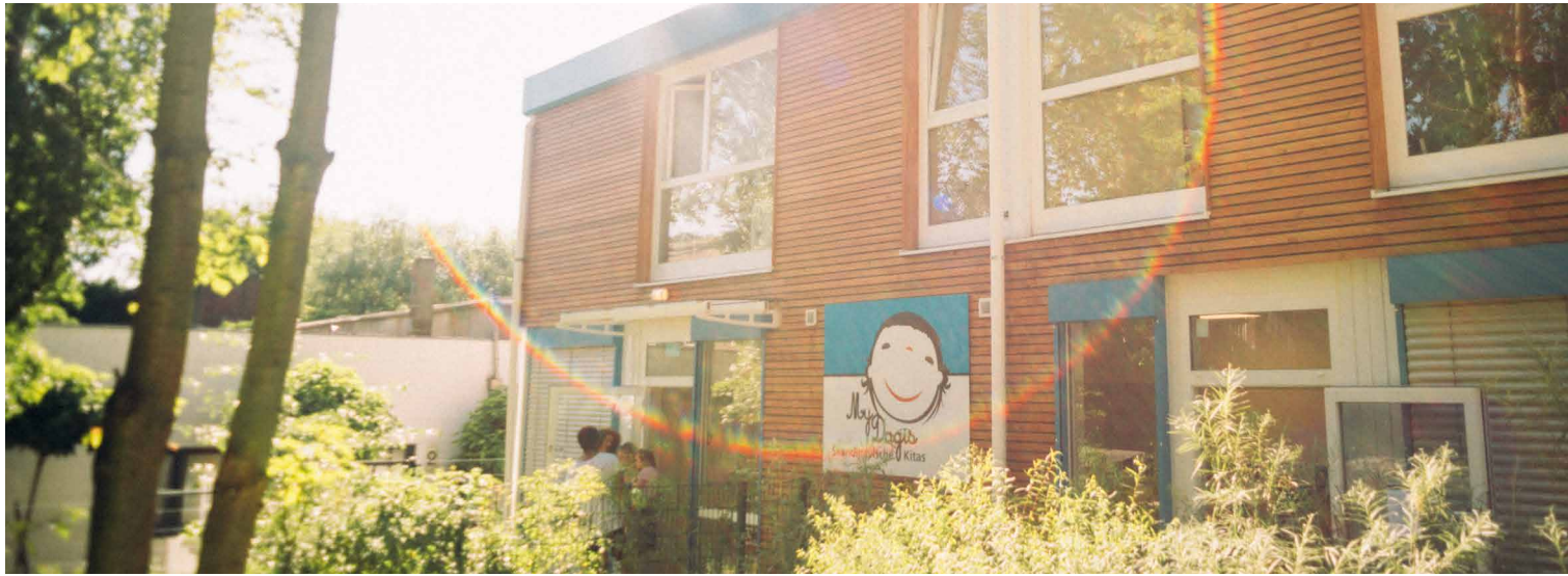
Kita in der Wachsfabrik