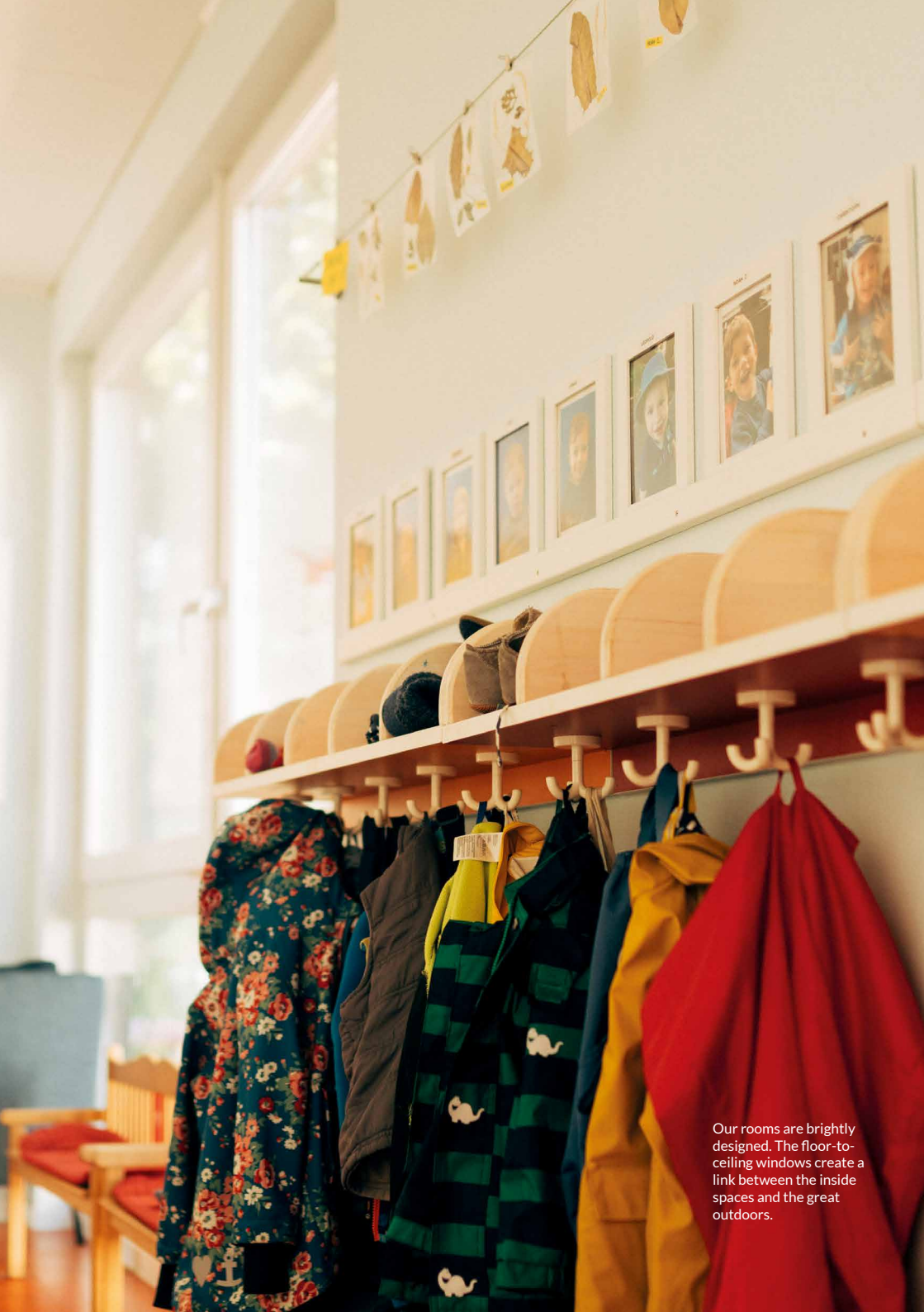
Our rooms are brightly designed. The floor-to-ceiling windows create a link between the inside spaces and the great outdoors.